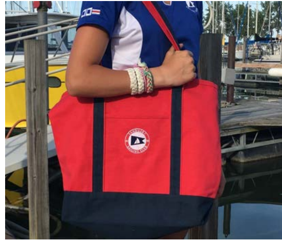
Beach Tote – Outside Pocket and Velcro Closure at Top 100% Cotton Canvas Red with Navy Bottom and Straps, SSC Logo on Front Size: 21 ½" x 15 ½" x 6 ½" Price: $20.00