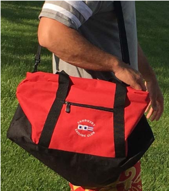
Duffle Bag – Heavy Duty Polyester with Adjustable Shoulder Strap, Top and Side Grip Handles, Front Zippered Pocket Red and Black with SSC Flags on Front Size: 22" x 11" x 10 ½" Price: $25.00