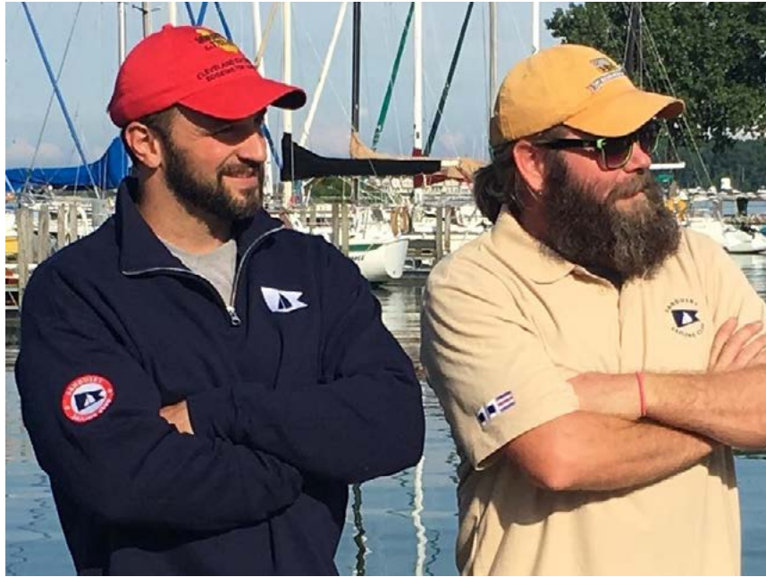
Unisex Quarter Zip Sweatshirt – Soft and Cuddly 50/50 Cotton/Polyester, Won't Shrink SSC Burgee on Left Chest, SSC Logo on Right Upper Arm Sizes: Small to X-Large Price: $32.00