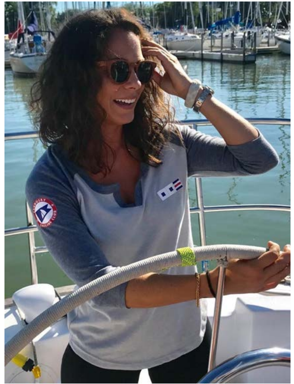
Women's Vintage T-Shirt – Extra Sporty, \frac{3}{4} Length Sleeves Silver Body with Soft Navy Detail, Curved Shirrtail Hem for Graceful Fit 50/50 Cotton/Polyester SSC Flags on Left Chest, SSC Logo on Right Upper Arm Sizes: Small to X-Large Price: $20.00