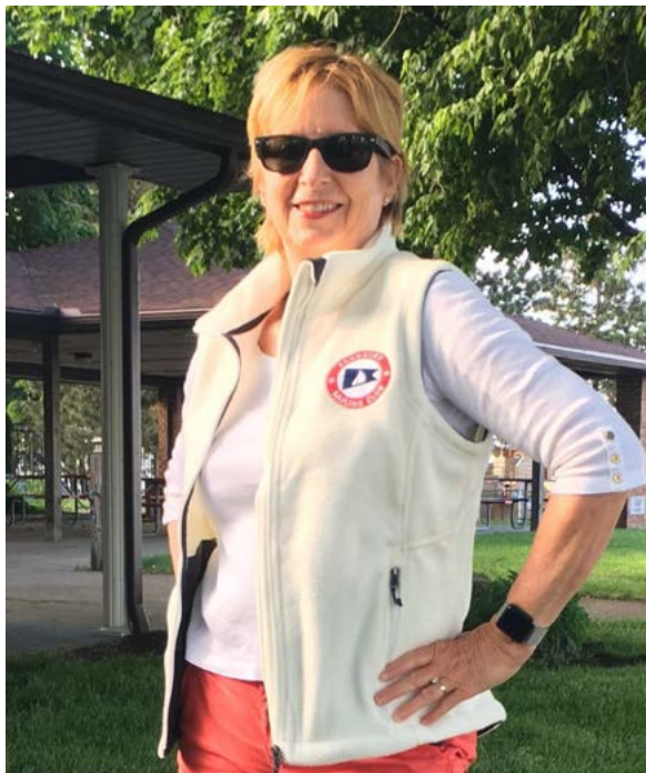
Women's Vest – Crisp Winter White, Front Zippered Pockets, Drawcords for Adjustable Hem Super Soft 100% Polyester SSC Logo on Left Chest Sizes: Small to X-Large Price: $29.00