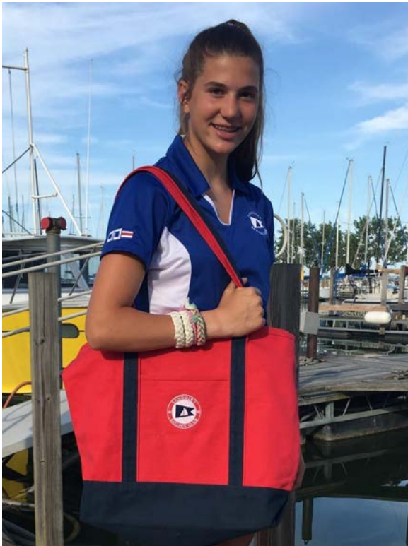
Lady's Sophisticated Polo – Gentle Contour Silhouette, Sharp White Detailing, Very Flattering!!! Cool 100% Polyester, Moisture Wicking SSC Logo on Left Chest, SSC Flags on Right Upper Arm Sizes: Small to X-Large Price: $32.50