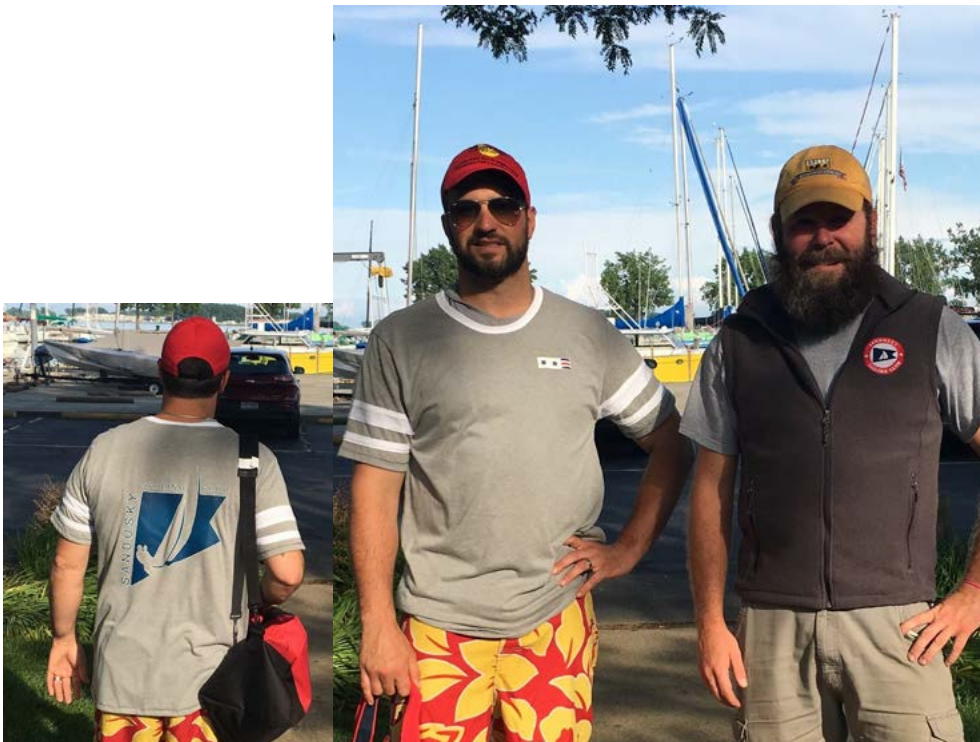
Men's Vintage T-Shirt – Extra Detailed, Relaxed Fit, Sharp Grey w/ Crisp White Accent 50/50 Cotton/Polyester SSC Flags on Left Chest, SSC Large Logo on Back Sizes: Small to X-Large Price: $22.00