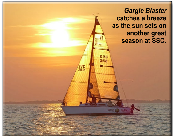
Gargle Blaster catches a breeze as the sun sets on another great season at SSC.

Thank you to all of our volunteers who have helped plan these projects.