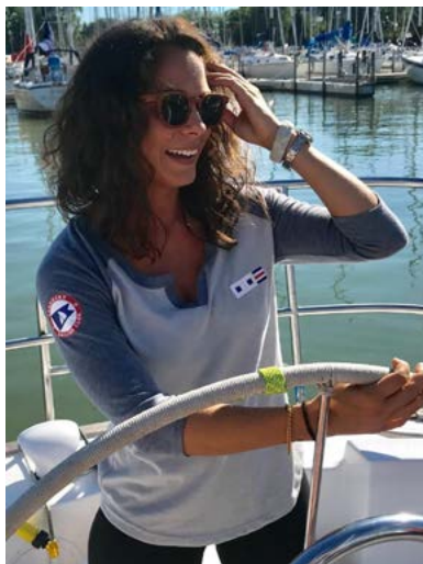
Women's Vintage T-Shirt – Extra Sporty, ¾ Length Sleeves Silver Body with Soft Navy Detail, Curved Shirttail Hem for Graceful Fit 50/50 Cotton/Polyester SSC Flags on Left Chest, SSC Logo on Right Upper Arm Sizes: Small to X-Large Price: $20.00