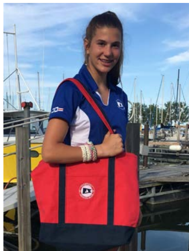
Lady's Sophisticated Polo – Gentle Contour Silhouette, Sharp White Detailing, Very Flattering!!! Cool 100% Polyester, Moisture Wicking SSC Logo on Left Chest, SSC Flags on Right Upper Arm Sizes: Small to X-Large Price: $32.50