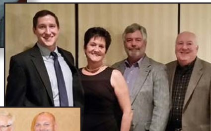
Above: Crew of Gargle Blaster celebrates a great season.