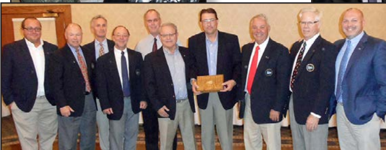
Left: Past and present Lyman Trophy winners