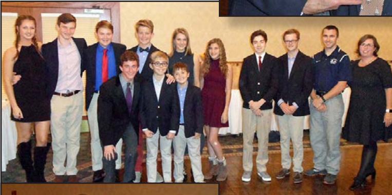
2016 Sandusky Junior Race Team